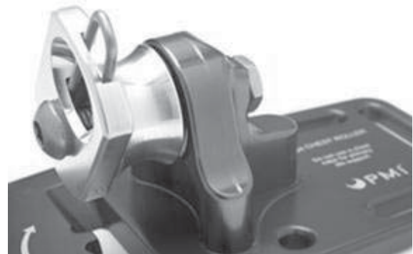
PMI Single Roller Close-up