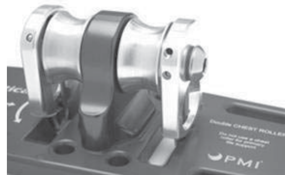
PMI Double Roller Close-up