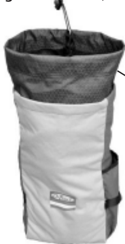
Standard Cave Pack

Additional shoulder straps available (see chart for ordering information)