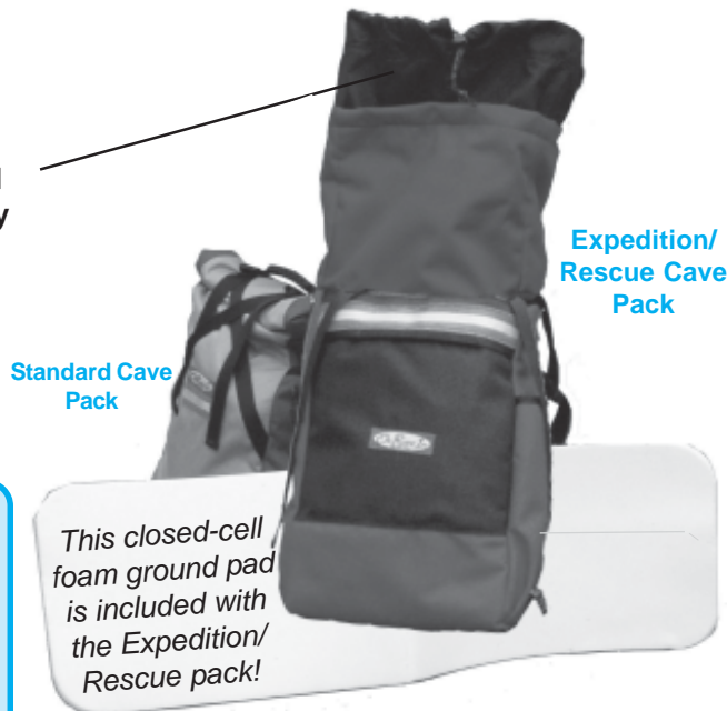
Expedition/Rescue Cave Pack

Optional rack pocket with ring-lock available on the Heavy-Duty and Standard cave packs. It is standard on the Expedition/Rescue pack!